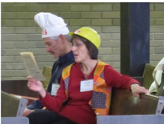
Christmas Pageant involves all members of the congregation