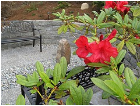
Contemplative Garden ~ Lenten Project 2009