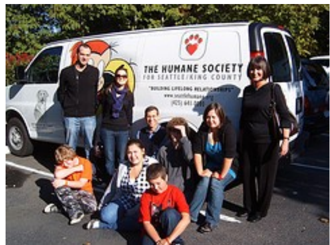
Youth visit Humane Society with donations