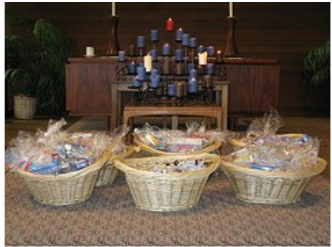
Candles for 40 Days of Prayer Collection of Toothpaste and Toothbrushes