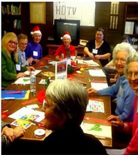
Women's Fellowship Program