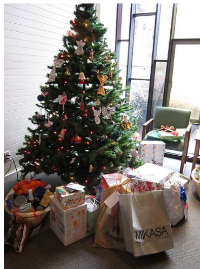
Tree of Angels